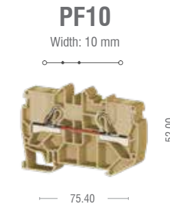
10 mm 2 PushFit Feed Through Terminal Block For 35 mm DIN Rail