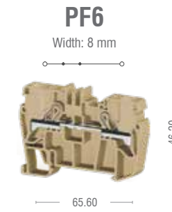
6 mm 2 PushFit Feed Through Terminal Block For 35 mm DIN Rail