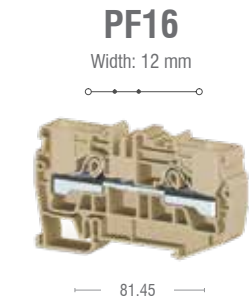
16 mm 2 PushFit Feed Through Terminal Block For 35 mm DIN Rail