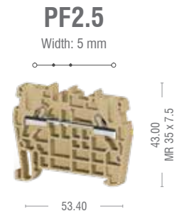
2.5 mm 2 PushFit Feed Through Terminal Block For 35 mm DIN Rail